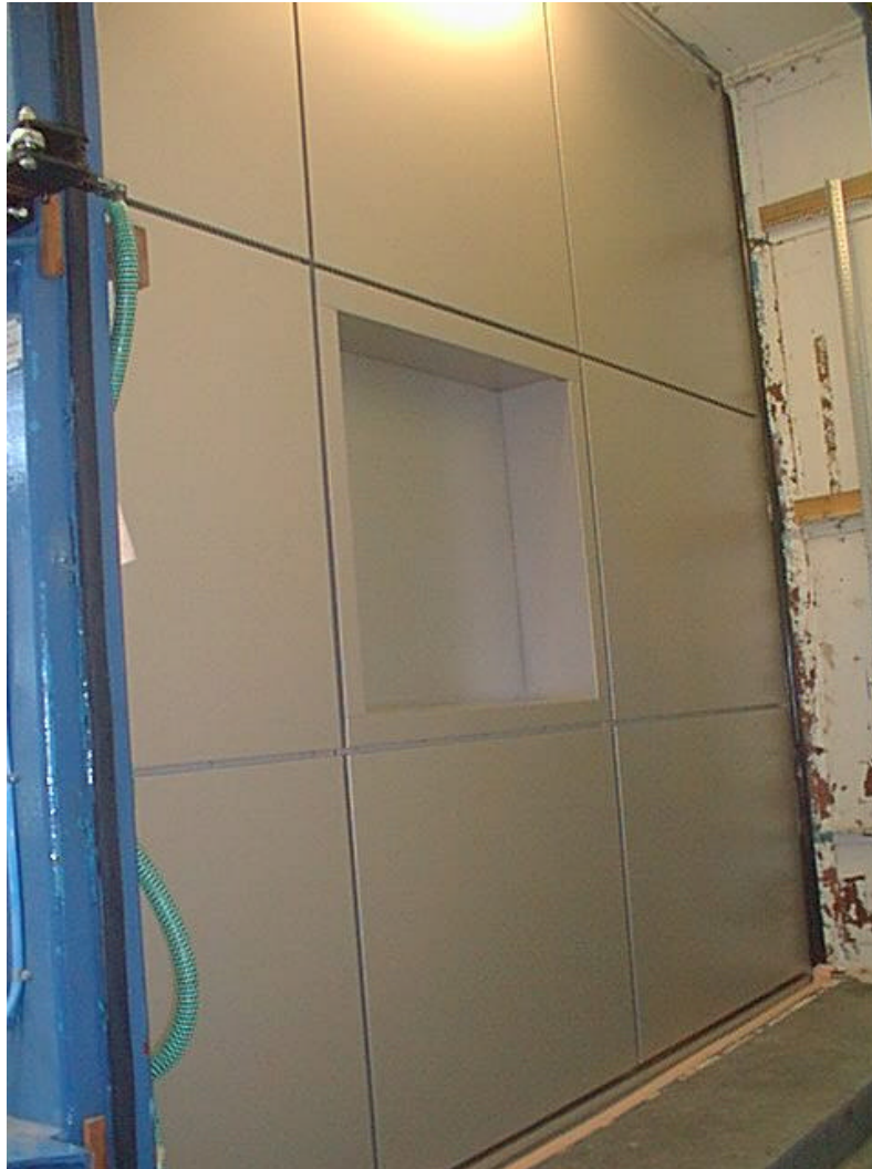
Figure A3. The outdoor face of the test specimen wall showing the Linear 1 rainscreen