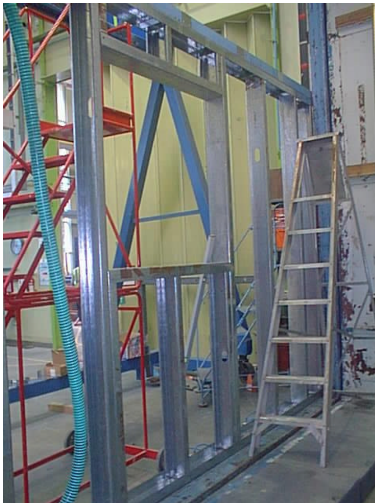
Figure A2. The Metsec metal frame from the outdoor face; under construction